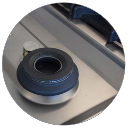
Fully moulded top, obtained from a large stainless steel plate