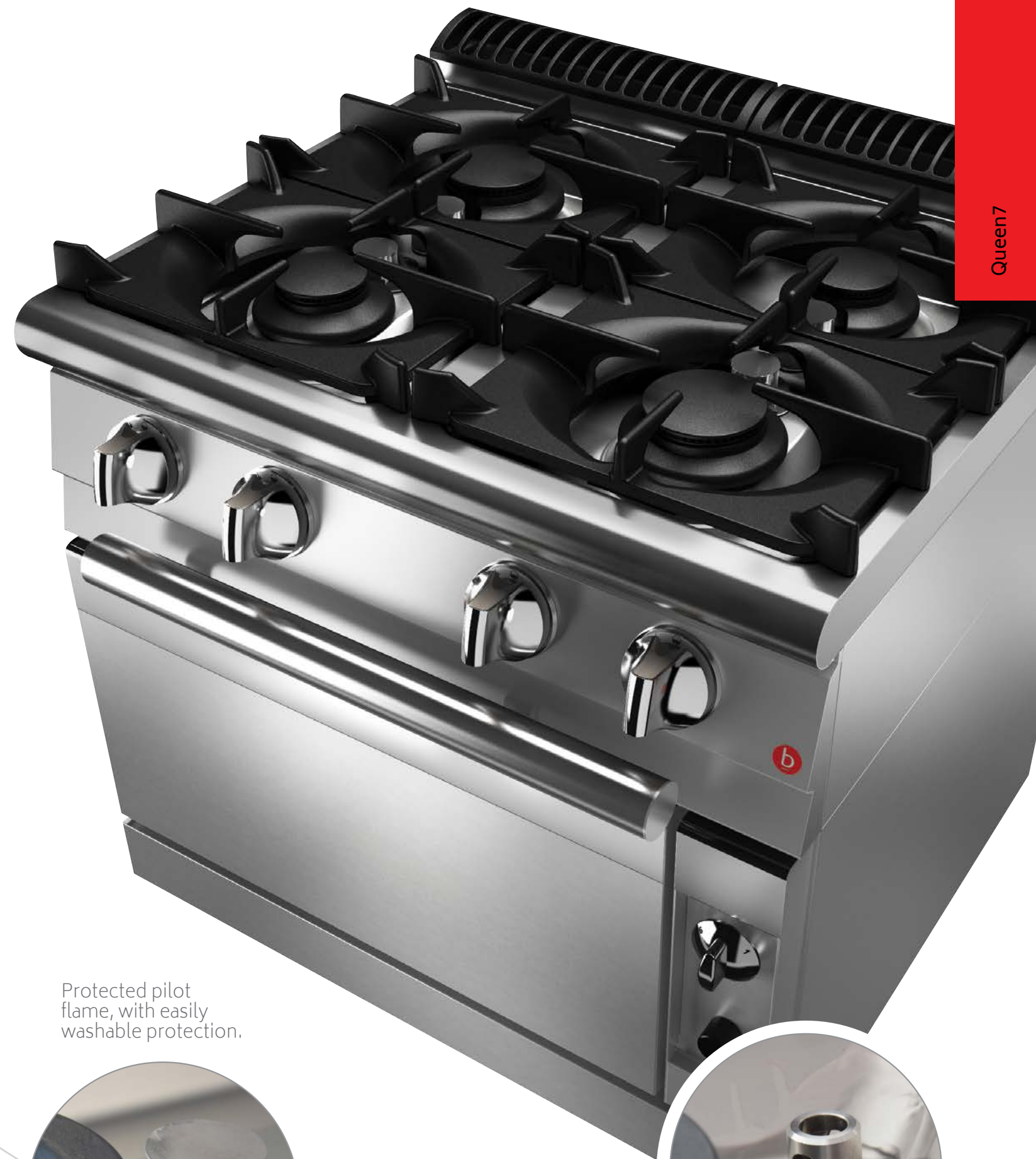
Protected pilot flame, with easily washable protection.