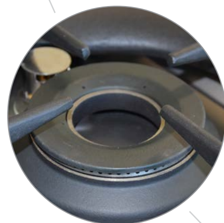
High power cast iron burners (3.5- 5.7- 7 kW)